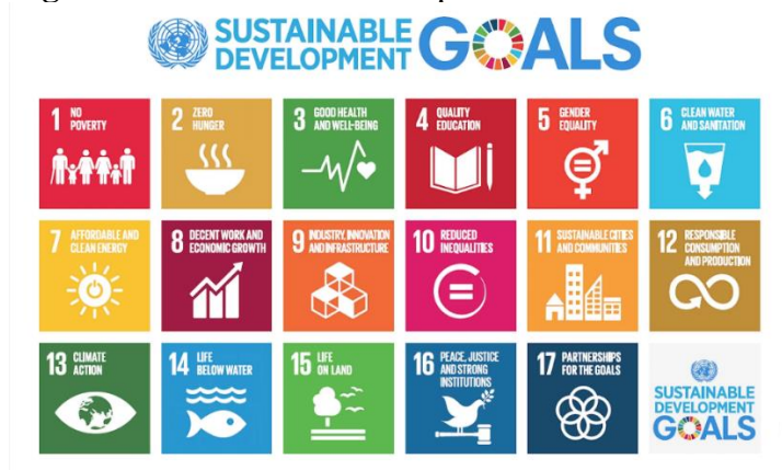
Figure 1 : Sustainable Development Goals

By adopting the Agenda, countries committed to taking bold and transformative steps to advance sustainable development over the next 15 years, leaving no one behind. The 17 SDGs that make up the 2030 Agenda are integrated and indivisible and mix, in a balanced way, the three dimensions of sustainable development: economic, social and environmental (Ribeiro et al., 2023).