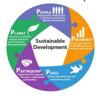
Figure 2: Areas of Sustainable Development

The SDGs are like a to-do list for governments, civil society, the private sector and all citizens on the collective journey to a sustainable 2030. The implementation of the 2030 Agenda, the SDGs and its targets will stimulate and support actions in areas of crucial importance for humanity: People, Planet, Prosperity, Peace and Partnerships, as can be summarized in Figure 2.